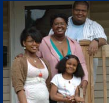
Duluth's "Sustainable Communities" initiative, called Creating Neighborhoods That Work—At Home in Duluth , recently was featured in National LISC's 2006 Annual Report. The story included photos of local families who have benefited from employer-assisted homeownership programs in Duluth.